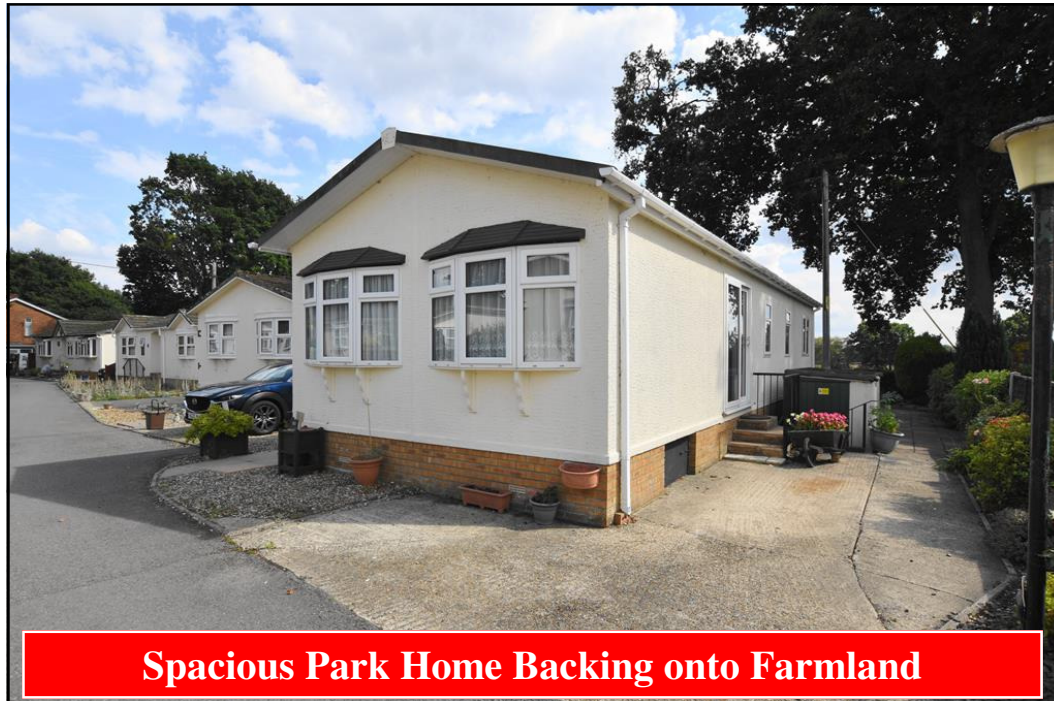
Spacious Park Home Backing onto Farmland

50 Hillbury Park, Hillbury Road, Alderholt, Fordingbridge. SP6 3BW